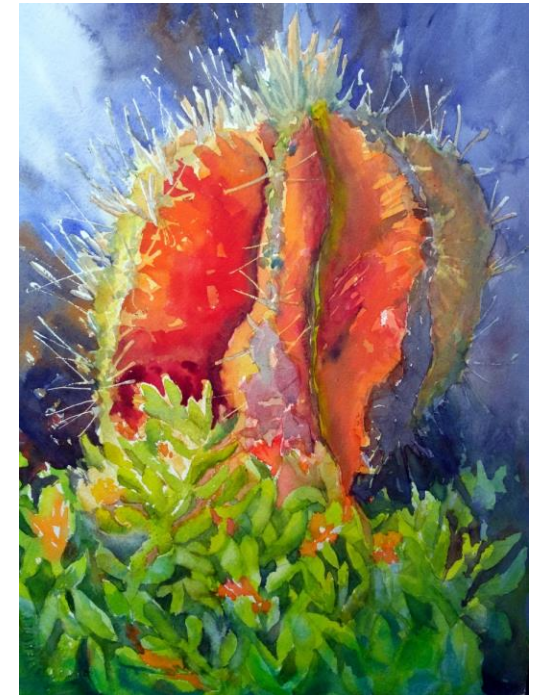
Cactus Queen by Rachel Murphree

The New Mexico Watercolor Society promotes awareness of the luminosity and lasting beauty of watercolor as a medium of creativity.