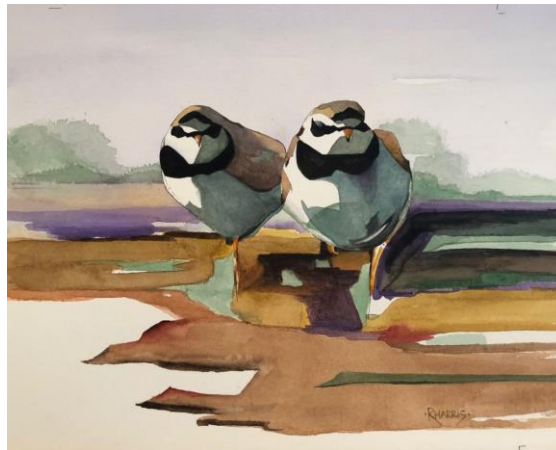
Bandits – Ringed Plovers